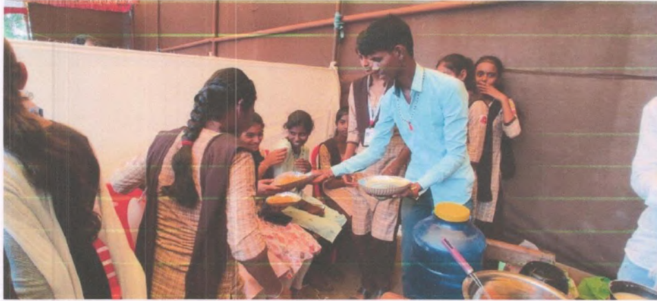
Students at their counters in food fest 2022.

SLM Coordinator IQAC G. P. PORWAL ARTS, COM & V. V. SALIMATH Sc. College, SINDGI-586128.