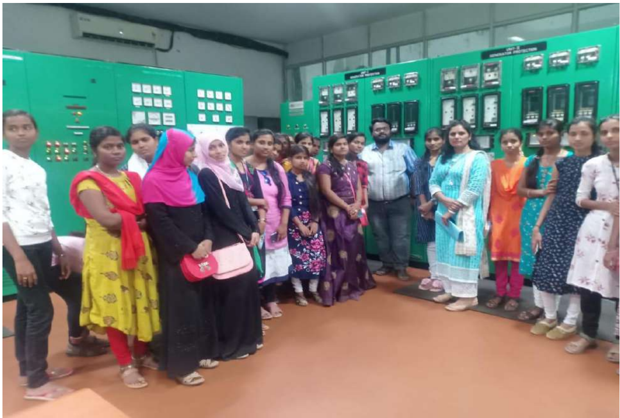
Narayanapur Power Station