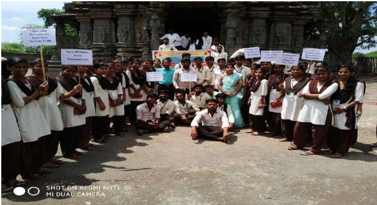
Historical Monuments in Chattaraki Village