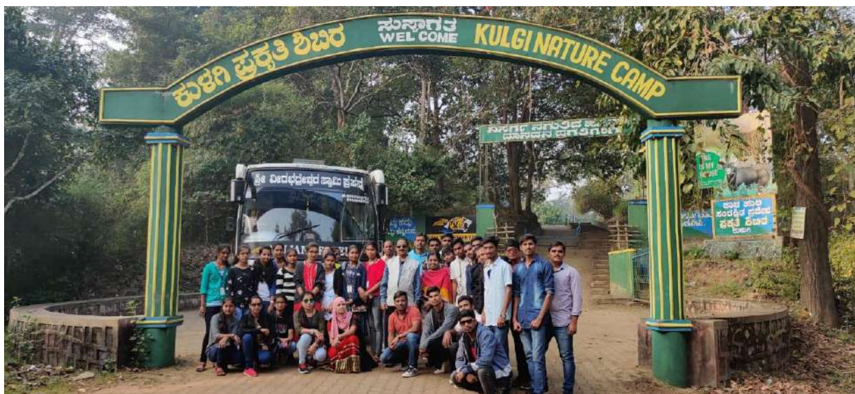
Kulagi Nature Camp Dandeli

Visit to Industry, Power Station, Forest Ecosystem, Coastal Region and Monuments by Chemistry, Physics, Botany, Zoology and history Students for Experiential Learning.