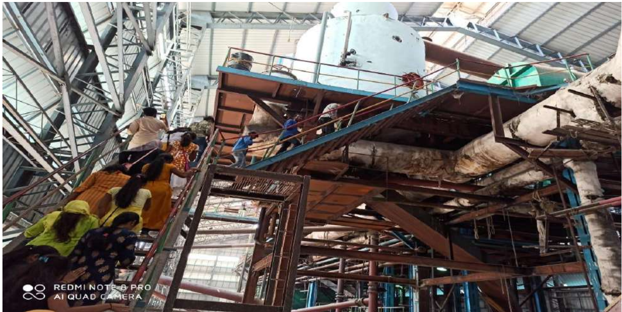
Sugar Industry Malaghan